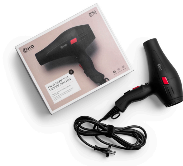
PRO DRYER 2000-ION