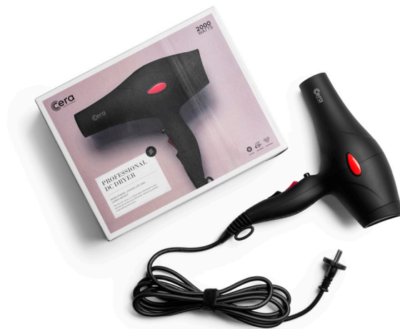
PRO DC DRYER