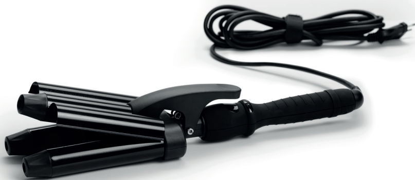
TRIPLE BARREL WAVER XL

Embrace the crimped hair of decades past with the Triple Barrel Waver XL – the styling tool that effortlessly creates a hairstyle full of XL texture and XL volume.