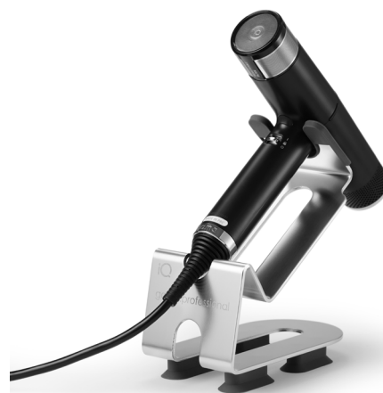
IQ DRYER HOLDER