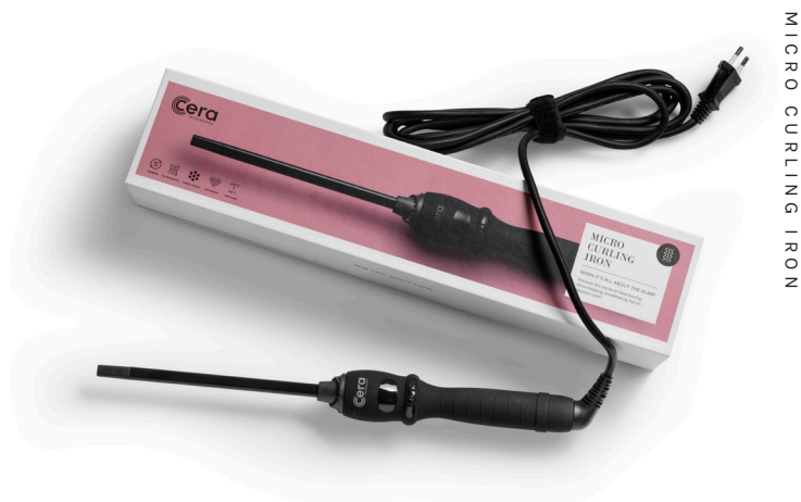
MICRO CURLING IRON