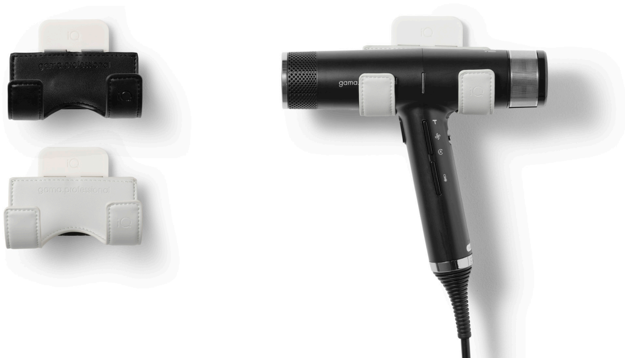
SMART WAIST & WALL HOLDER