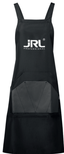
JRL ECO-FRIENDLY STYLIST APRON