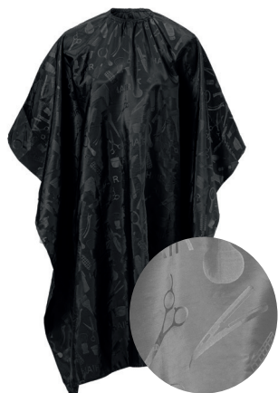
CUTTING CAPE, SALON TOOLS