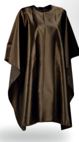
WAKO SATIN CAPE BRONZE