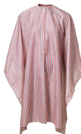
CUTTING CAPE, COLOR PINSTRIPES