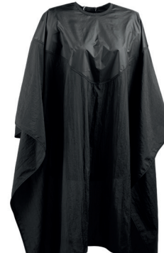
WAKO PROTECTING CAPE 2