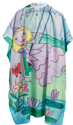
CHILD CAPE, PRINCESS