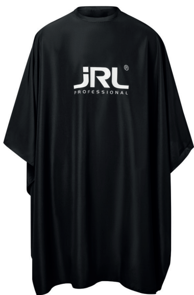
JRL ECO-FRIENDLY CUTTING CAPE