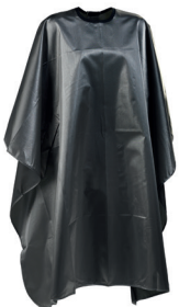
WAKO SATIN CAPE GUNMETAL