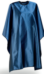
WAKO SATIN CAPE ROYAL BLUE