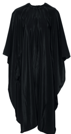
CUTTING CAPE, SILKY