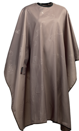
WAKO SILHOUETTE CAPE