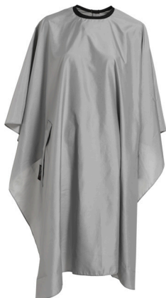
WAKO SOFT CAPE, SOFT GREY