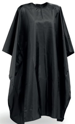
WAKO E-GUARD, BLACK