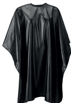
WAKO TINTING CAPE LACQUER