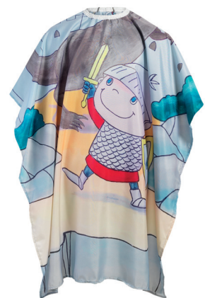
CHILD CAPE KNIGHT

Benefits: Kid-sized. Usage: Cutting and Styling. Material: Polyester. Design features: Water repellent, Clasp hook neck closure. Size: W90 cm x L130 cm.