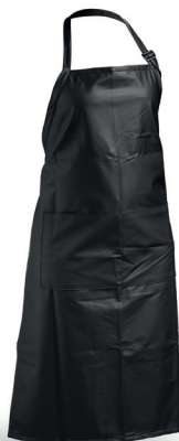
WAKO STYLIST APRON DE LUXE