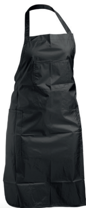
WAKO NYLON APRON, SMALL