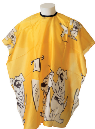
CHILD CAPE, DOGGY YELLOW