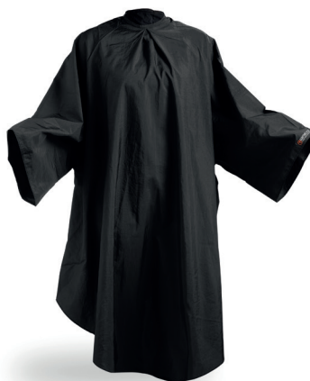
WAKO CUTTING DRESS