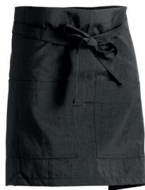
WAKO ARTISAN MINI APRON