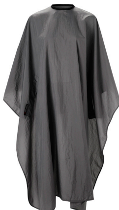
WAKO LONG CAPE, GREY