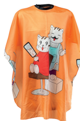
CHILD CAPE, CATS