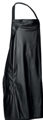
WAKO TINTING APRON, LACQUER