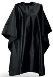
WAKO SATIN CAPE BLACK