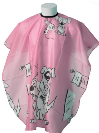
CHILD CAPE, DOGGY PINK