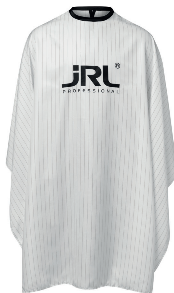
JRL CLASSIC STYLING CAPE