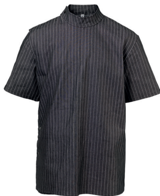
BLACK PINSTRIPED BARBER JACKET