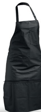
WAKO ZIPPER APRON