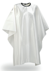
WAKO SATIN CAPE WHITE