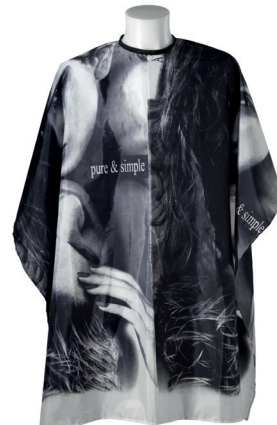
CUTTING CAPE, PURE AND SIMPLE