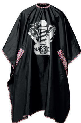
CUTTING CAPE, BARBER SHOP