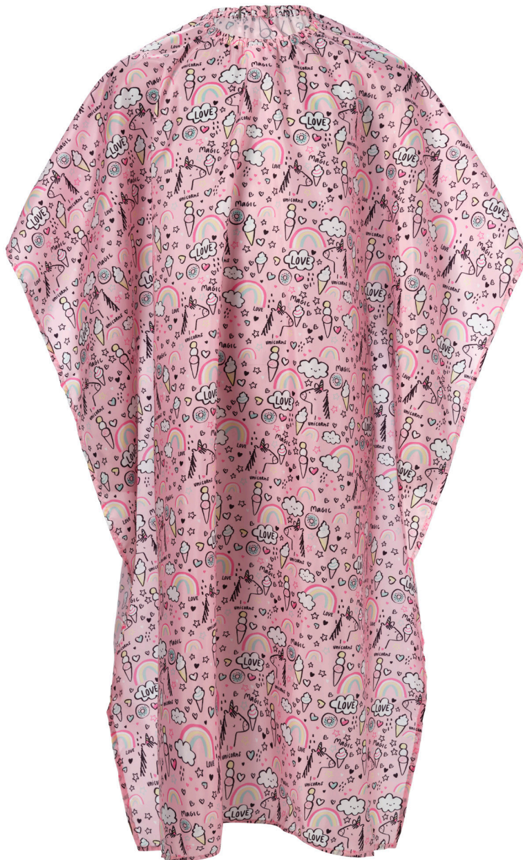
CHILD CAPE UNICORN

Benefits: Kid-sized. Usage: Cutting and Styling. Material: Polyester. Design features: Water repellent, Clasp hook neck closure. Size: W90 cm x L125 cm.