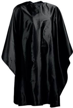
WAKO SATIN CAPE W. BUTTONS