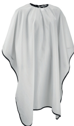
CUTTING CAPE, BARBER