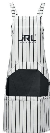
JRL CLASSIC STYLIST APRON