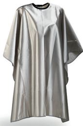
WAKO SATIN CAPE SILVER