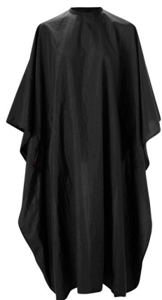
WAKO LONG CAPE, BLACK