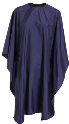
WAKO SOFT CAPE, INDIGO BLUE