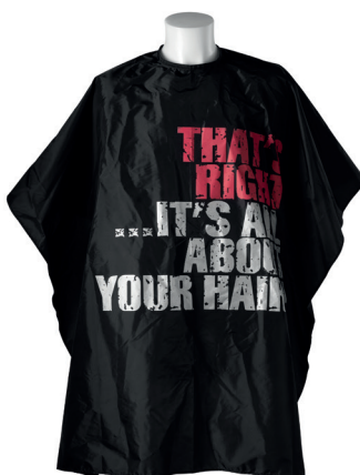
CUTTING CAPE, ATTITUDE