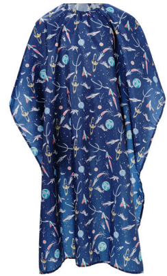
CHILD CAPE ROCKET

Benefits: Kid-sized. Usage: Cutting and Styling. Material: Polyester. Design features: Water repellent, Clasp hook neck closure. Size: W90 cm x L125 cm.