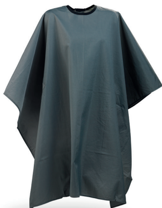
WAKO CRINKLE CAPE, GREY