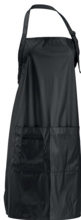
TINTING APRON, LIGHT