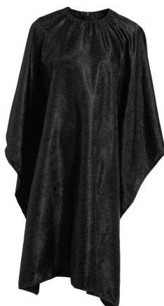
CUTTING CAPE, PAISLEY