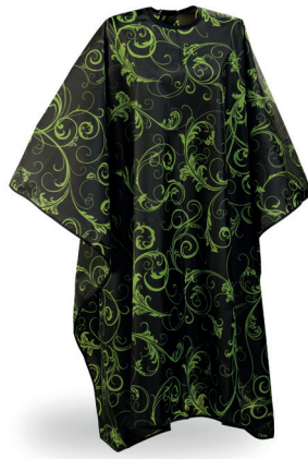
WAKO IVY GREEN CAPE