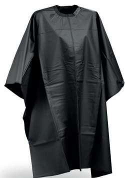
WAKO WIDE HAIR-DYE CAPE