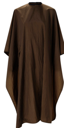
WAKO LONG CAPE, MOCCA