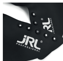
JRL CUTTING COLLAR