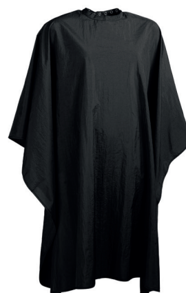
WAKO CRINKLE CAPE W. BUTTONS