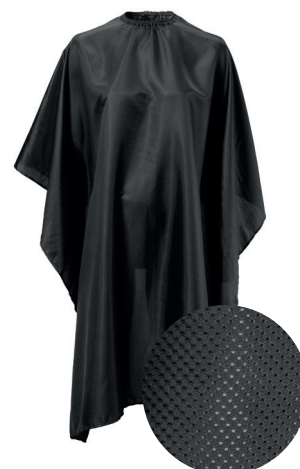
CUTTING CAPE WITH DOTS