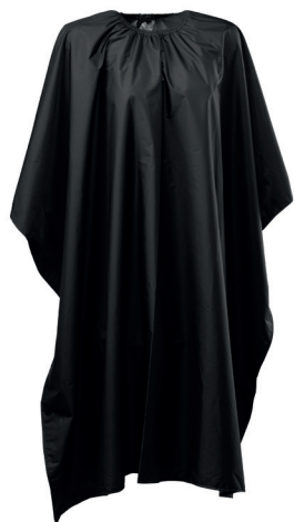
TINTING CAPE, LIGHT