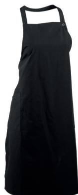
WAKO CLEAN APRON