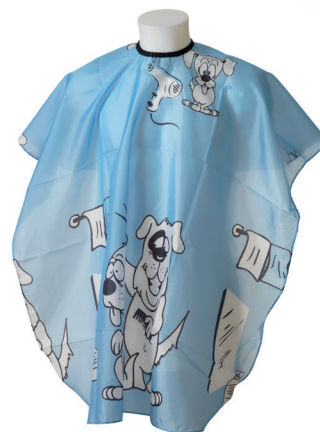
CHILD CAPE, DOGGY BLUE