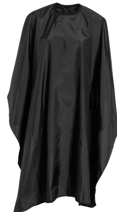
WAKO SOFT CAPE BLACK

Art.Nr: 5645 (Web), 5646 (Baroque) , 5647 (Rose), 5648 (Cafeteria)