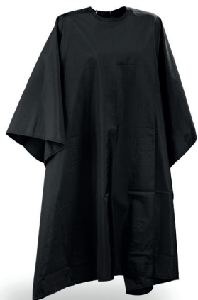
WAKO CRINKLE CAPE, BLACK