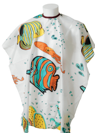
CHILD CAPE, SEA