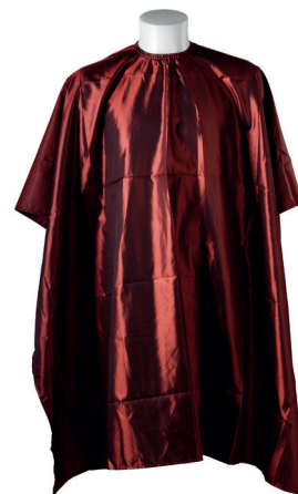
CUTTING CAPE ZIG-ZAG, RED