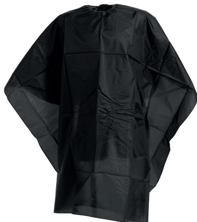
CUTTING CAPE, BASIC