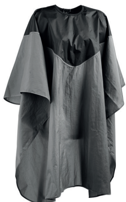
WAKO PROTECTING CAPE 2