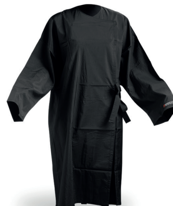
WAKO CLIENT WRAP KIMONO