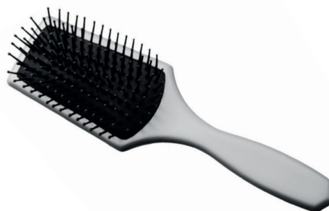
PADDLE BRUSH SILVER MINI