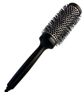
HOT CURLING 33