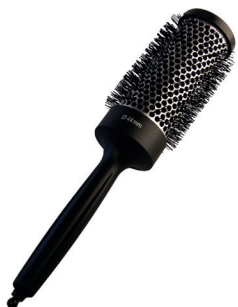
HOT CURLING 44