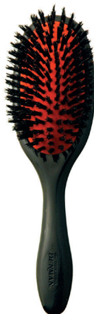
D82M 100% BOAR