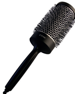
HOT CURLING 53