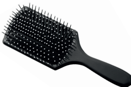
PADDLE BRUSH CLASSIC