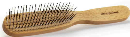
WOOD BRUSH SCALP