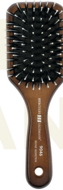
WOOD BRUSH 9046