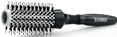
ULTRA LIGHT 33

The Ultra Light brush from Bravehead features a unique bristle-embedded system where the bristles are tufted onto a hollow aluminium barrel. This technique makes the brush much lighter in weight and therefore minimizing fatigue on arm and hand. Ceramic barrel maximizes heat and faster drying. 100% natural boar and tourmaline nylon bristles that add shine, smoothness and controls frizz.