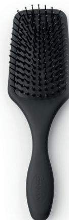
D84 PADDLE BRUSH SMALL