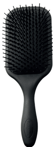
D83 PADDLE BRUSH LARGE