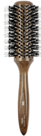
WOOD BRUSH 9029