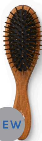
CUSHION BRUSH MASSAGE