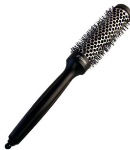
HOT CURLING 25