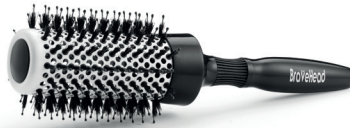
ULTRA LIGHT 44