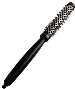
HOT CURLING 16