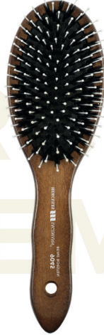
WOOD BRUSH 9045