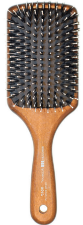
WOOD BRUSH 9047