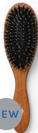
CUSHION BRUSH SMOOTH & SHINE