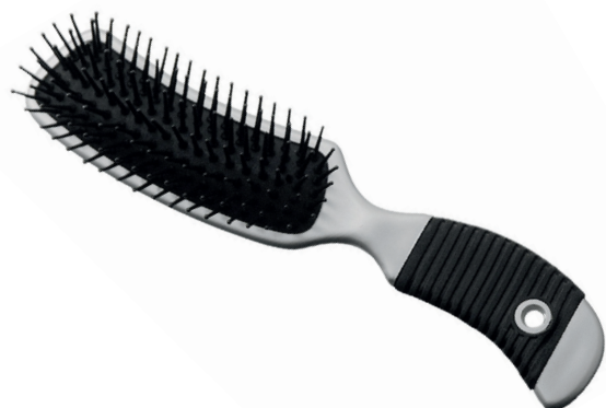
BANANA BRUSH SILVER