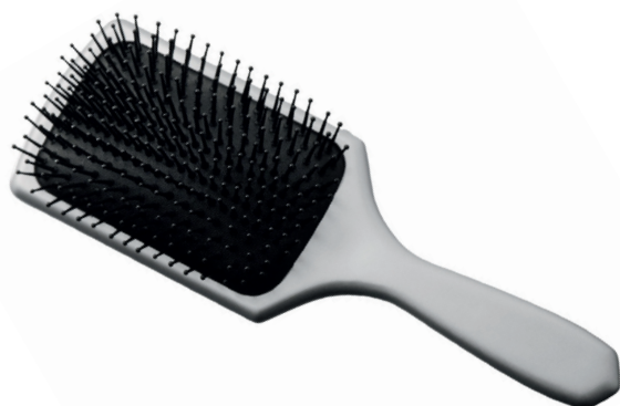
PADDLE BRUSH SILVER