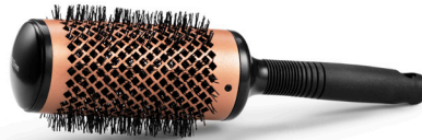
COPPER THERMAL 53